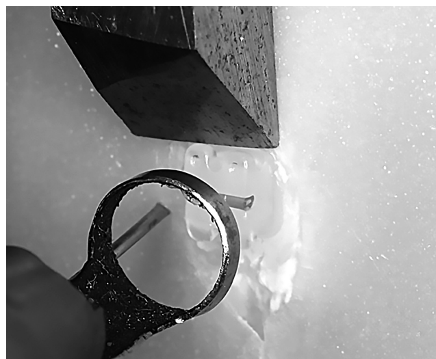
Figure 1 - Specimen with the active chisel tip acting on the upper part of the bracket base during the shear bond strength test.

The debonded specimens were observed with a 10x stereomicroscope (Carl Zeiss, Goettingen, Germany) by an calibrated and experienced examiner, in order to assess the amount of resin material adhered to enamel