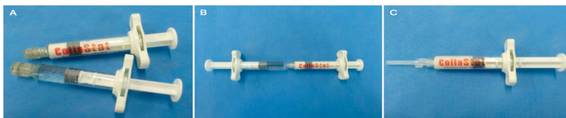
Figure 1. Preparation of CollaStat ® . (A) CollaStat consists of two syringes: one for collagen granules and thrombin and the other for CaCl 2 solution. (B) CollaStat ® can be easily prepared by connecting the two syringes and mixing them. (C) After mixing and detaching the CaCl 2 syringe, CollaStat is ready for use by connecting the enclosed application tip.

The T-C matrix (CollaStat ® ; Dalim Tissen Co. Ltd., Seoul, Korea) is a flowable collagen-based hemostatic matrix [18,19]. The T-C matrix is comprised of two connectable syringes, syringe A and syringe B. Syringe A contains porcine skin-derived atelocollagen, thrombin. Syringe B contains calcium chloride solution (Figure 1). The collagen granules of T-C matrix are made from highly purified type I atelocollagen derived from the porcine dermis, which shows biocompatibility due to the minimally immunogenic, biocompatible, and biodegradable properties of atelocollagen. The matrix can be prepared after mixing the materials in the syringes. In the intervention group, T-C matrix was applied to the anastomosis site and pancreatic stump after PJ or DP. The matrix was approved for use by the Korean Food and Drug Administration.