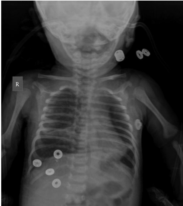
Figure 2. The Patient's Chest Roentgenogram Demonstrated Bilateral Pulmonary Infiltrations and Atelectasis