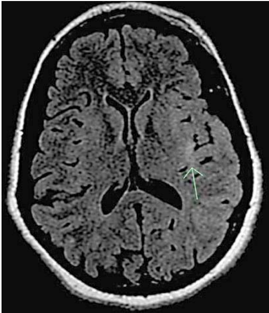
Fig. 1. MRI axial FLAIR with increased signal intensity at the medial temporal lobe (arrow).