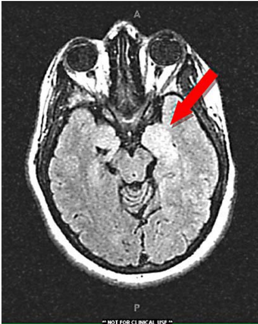
Fig. 3. MRI axial T2-weighted image identifying increased signal intensity at the left temporal lobe (arrow). Image contrast brightened.