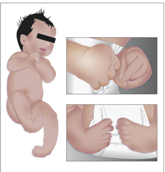
FIGURE 1 | Morphological features of distal arthrogryposis. A child born with distal arthrogryposis, showing characteristic camptodactyly, such as one or more fingers permanently bent. The characteristic clubfoot is also seen, as well as the abnormal finger positions of the hand (Modified from Chen, 2015).

Distal Arthrogryposis Type 2 is further classified into two groups termed as DA2A (FSS) and DA2B (Sheldon-Hall syndrome). DA2B is an intermediary phenotype between DA1 and FSS. DA2B is also referred to as a variant of FSS (Krakowiak et al., 1998). Clinical features are likely similar to those of DA1, including ulnar deviation, overriding fingers at birth and camptodactyly. Major clinical features for this type are related to lower limbs and consist of talipes equinovarus (clubfoot), calcaneovalgus deformities, vertical talus (flatfoot),