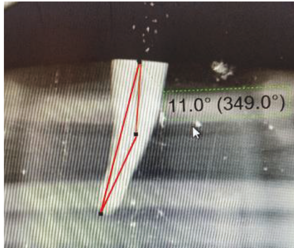
FIGURE 1: Lower first premolar with a 11° curvature that matched the teeth selection criteria in this study.