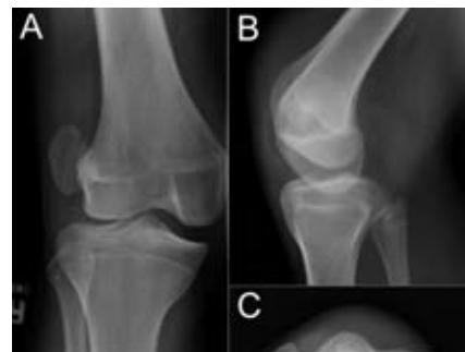
Figure 2. AP (A), lateral (B) and Merchant (C) radiographic views of the patella demonstrates the patella dislocated in the lateral gutter. On the Merchant view (C), femoral trochlea dysplasia is not seen. This was further confirmed intraoperatively.