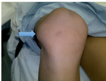
Figure 1. Picture taken of the patient's knee in clinic. Blue arrow points to the dislocated patella and deformity. The patient and parents noted this deformity since childhood.

In our present case, the patient has a history of traumatic knee injury in his childhood that was likely consistent with an acute patella dislocation. He presented to our clinic with a chronically fixed lateral patella dislocation