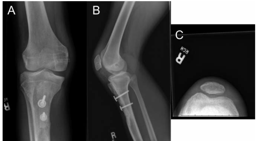
Figure 5. AP (A), lateral (B), and Merchant (C) radiographic views of the knee at the 1 year follow-up visit. The patella is anatomically located in the trochlea groove with union of the distal tibial tubercle osteotomy site.

motion is started post-operatively to prevent stiffness and patients are allowed to weight-bear as tolerated in a knee immobilizer until knee motion and quadriceps function has returned to normal. 7,14 Long-term follow-up of MPFL reconstruction demonstrates satisfactory results in the majority of patients. Nomura et al. 15 evaluated 24 knees from 22 patients after MPFL reconstruction with a mean follow-up of 11.9 years and found 88% of patients had excellent/good outcomes according to the Crosby/Insall criteria. Twelve percent of patients had fair/poor outcomes and no patients were worse at follow-up. Anteromedial tibial tubercle transfer is the procedure of choice for patella instability with a TT-TG distance of >20 mm and patella articular degeneration (lateral and distal facet) caused by mal-alignment. The osteotomy plane is deep to the tibial tubercle, and should be fairly steep to allow for 12-15 mm of anteriorization of the tubercle, which will help unload the patella. Balancing the amount of anteriorization versus medialization can be done by changing the slope of the osteotomy. Fulkerson et al. 9 reported 93% excellent/good results subjectively at two-year follow up and 89% excellent/good results objectively using the knee instability scale.