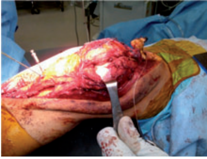
Figure 4. Intra-operative photograph of the V-Y lengthening of the quadriceps tendon and also the distal tibial tubercle realignment. Photograph taken before the medial patellofemoral ligament reconstruction.