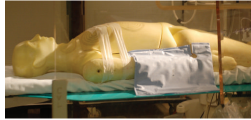
FIGURE 2: Drape 1.

All imaging was acquired with fluoroscopy set to “low” (15 frames/sec, 4 rad/min, max 120 kV), cinematic acquisition imaging frame rates at 15 frames/sec, source to image distance at 100 centimeters, focal distance at 20 cm, and table height at 85 cm. Images were acquired in the standard manner with the assistance of an experienced radiographer behind a transparent 1.0-cm lead screening between operator and mock patient and adhering to the American Association of Physicists in Medicine’s guidelines for proper use of ionizing radiation equipment in the cardiac catheterization laboratory [13]. Each trial run consisted of three fluoroscopy views at 2 minutes each (center of the chest, left anterior oblique (LAO) 30 degrees and right anterior oblique (RAO) 30 degrees) and four cineangiography views at 8 seconds per angulated view (LAO 30 Caudal 30, AP Caudal 30, LAO 30 Cranial 30, and RAO 30 Cranial 30). Two experimental runs