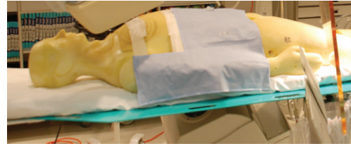
FIGURE 3: Drape 2.

were completed for a control and each of the 3 lead-free drapes.