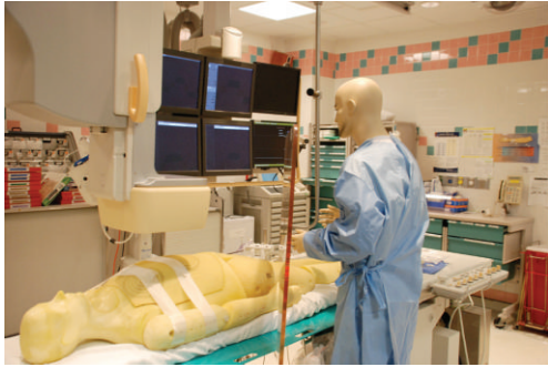
FIGURE 1: Simulated laboratory setup.