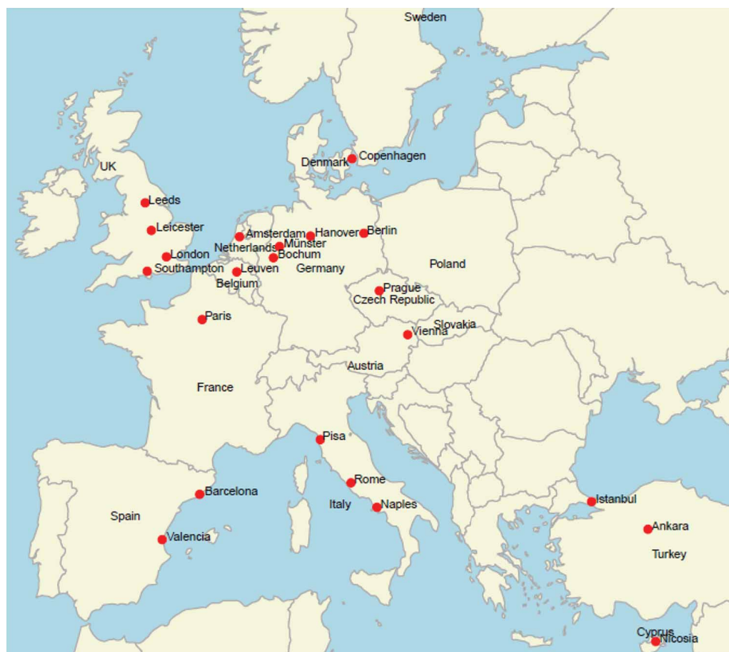
FIGURE 1 Map showing the participating centres of the clinical trial network for primary ciliary dyskinesia (PCD-CTN) (red dots). The PCD-CTN consists of 22 trial sites from 12 European countries including >3000 children and adults with PCD. The map was created with R [16] and RStudio [17], the packages “maps” [18], “ggplot2” [19] and “dplyr” [20] were used.

The ERN-LUNG International PCD Registry was initially launched in 2014 within the BESTCILIA project [15]. It has lately been expanded through the REGISTRY WAREHOUSE project of ERN-LUNG [2]. The registry aims to facilitate the recruitment of patients for clinical and research studies. Data on family history, symptomatology, socioeconomic status, clinical manifestations, disease course, treatments, outcomes and natural history, as well as diagnostic data, are collected. Patient data are continuously contributed by participating centres [2]. To participate in the ERN-LUNG International PCD Registry the centres need to meet the necessary legal and ethical requirements, which are dependent on national conditions. The registry management team assists with all necessary processes. Participation in the registry is mandatory to become a member or associated partner of ERN-LUNG PCD Core. The ERN-LUNG International PCD Registry is registered in the European Rare Disease Registries Infrastructure ( https://eu-rd-platform.jrc.ec.europa.eu/erdri_en ).