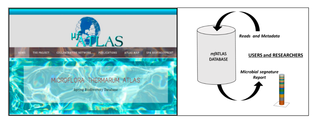
Figure 2. The mfAtlas database: presently, the database is accessible to the research network at www.mfATLAS.it. The database is designed to be further extended to harbour information such as water management, environmental and epidemiological data, international legislations.

Treatments for Spa and Medicinal Natural Waters: Limits and Perspectives