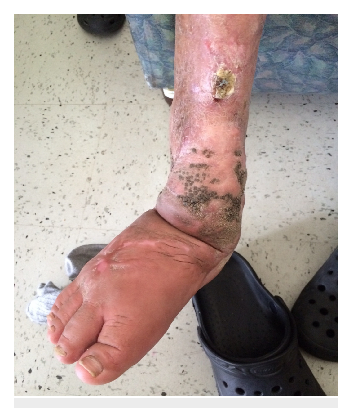
FIGURE 3: Clinical evolution before discharge