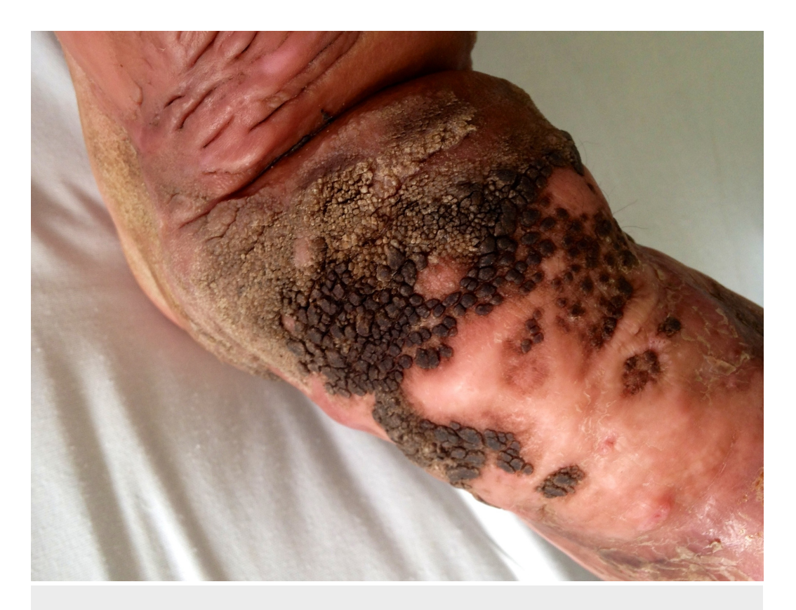
FIGURE 1: Clinical presentation at admission

It shows leg changes secondary to infection at admission. The associated verrucous lesions and pigment changes are evident.