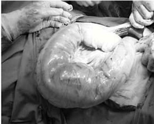
Fig. 3. The patient during surgery.