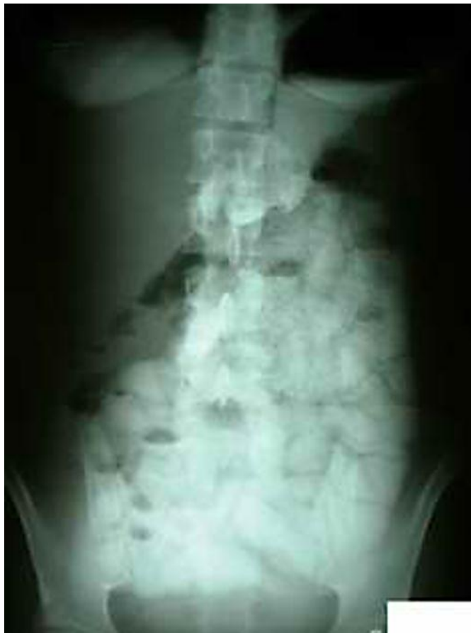
Fig. 4. Abdominal X-ray at follow-up.