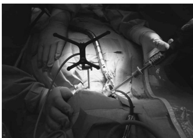
Figure 2. Minimally invasive cervical pedicle screw insertion. Cannulated pedicle screw inserted over the K-wire. Application of a self-retaining tubular retractor with illumination.