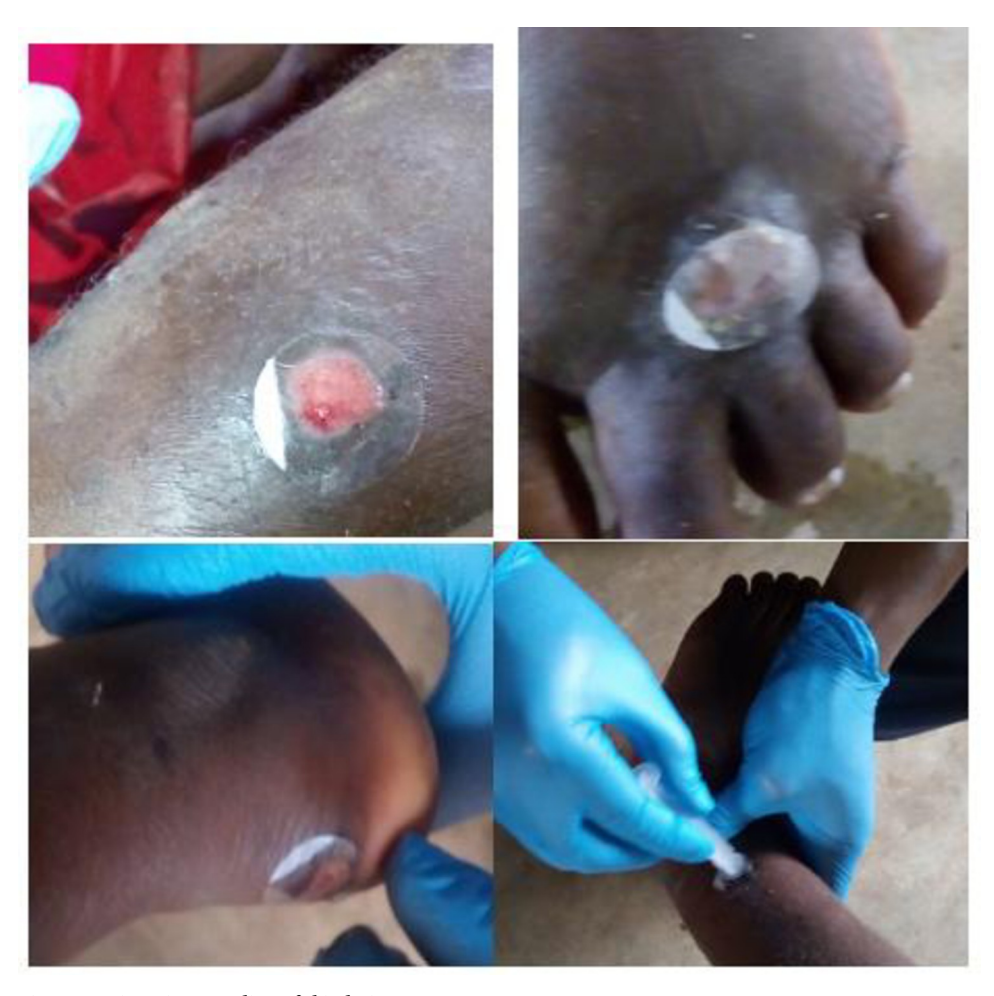
Fig 1. Non-invasive sampling of skin lesions.

https://doi.org/10.1371/journal.pntd.0009416.g001