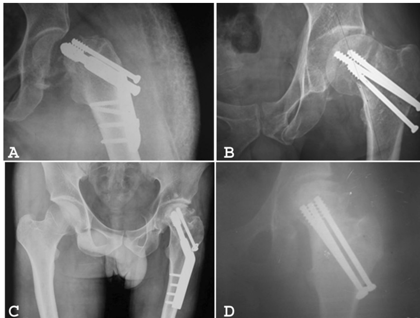
Fig. 3. A: Cutting through of the sliding hip screw from the femoral neck at 6 weeks after fixation. B: Implant failure 6 weeks after fixation with CCS. C: Avascular necrosis in a patient detected 2 years after fixation with sliding hip screw. The fracture has united. D: Avascular necrosis in a patient detected 1 year after fixation with CCS. The fracture has united.