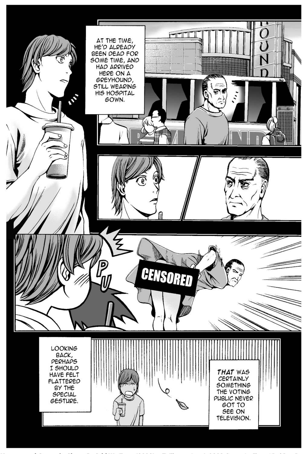
Figure 2. Dean Koontz and Queenie Chan, In Odd We Trust (2008) p.7. These figures have been reproduced with permission from Queenie Chan.

discuss this point in this paper, though we would like to conduct further research on it, as well as on how much onomatopoeias