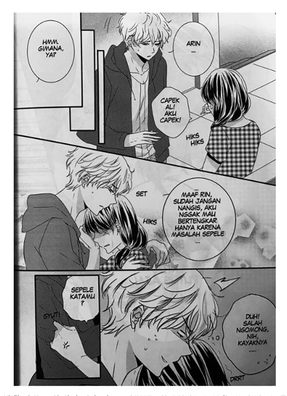
Figure 4. Annisa Nisfihati, Me vs. Big Slacker Baby , chapter 6 (2016) p. 33. © 2016 Annisa Nisfihani/re:ON Comics. This figure has been reproduced with permission from re:ON Comics.

sound-symbolic words has always posed a challenge as experimental uses of these words in modern poems were often difficult to translate.