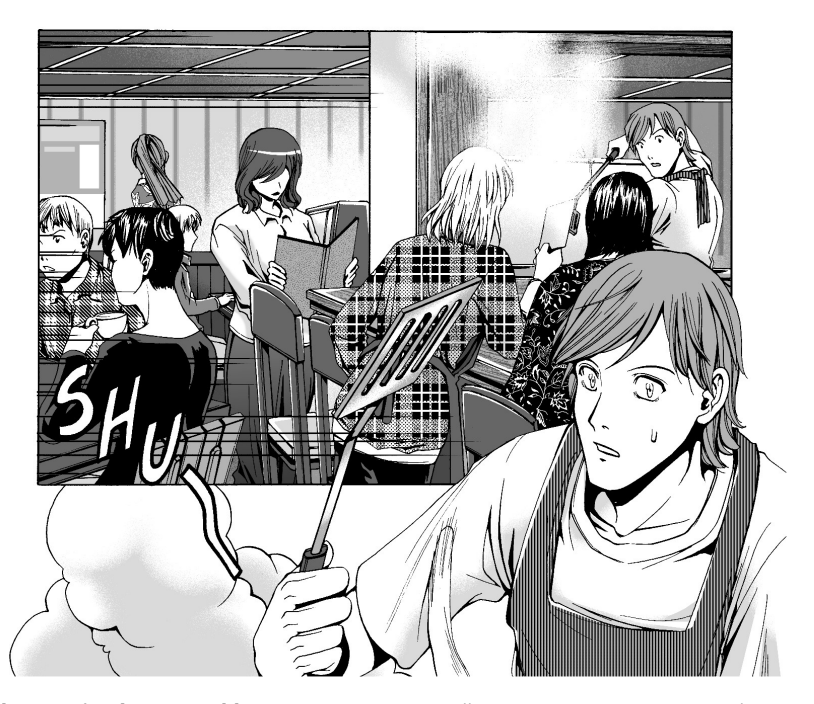
Figure 3. Dean Koontz and Queenie Chan, In Odd We Trust (2008) p.12. Illustration © 2008 Queenie Chan / Del Rey Books. These figures have been reproduced with permission from Queenie Chan.

The hybridization of the appearance of sound-symbolic words is also evident. In Hiro Nurhadi's Ankala , which was serialized in an Indonesian bi-monthly manga magazine, Shonen Fight , from 2015 to 2016,<sup>14</sup> the artist uses a distinctive font for the sound-symbolic words (Nurhadi, 2015: 222–245). The font reflects katakana-inspired fonts, such as Tokyosoft created by Shrine of Isis in 1998, or Electroharmonix published by Ray Larabie in 2015. The technique of using stylistic