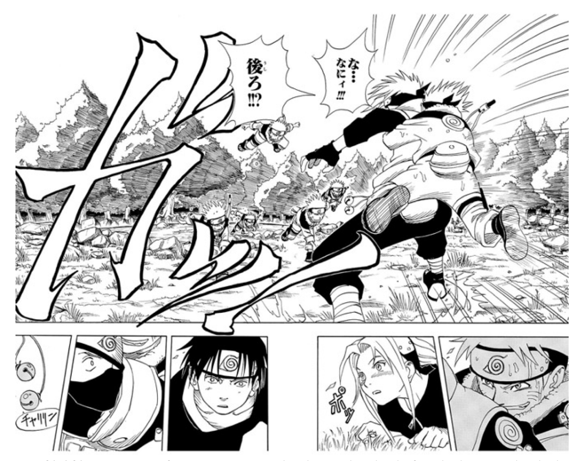
Figure 1. Masashi Kishimoto, Naruto, vol. 1 (2000). ©2000 Masashi Kishimoto/Shūeisha. This figure has been reproduced with permission from Shueisha.

Although hiragana and katakana have been the main writing devices used for the sound-symbolic words in manga, the modern English alphabet has also been used. While the use of Roman letters is not common in major Japanese manga compared to the cases in other countries, discussed by Valero Garcés (2008), we can find the ingenuity of some Japanese artists in words such as "BOMB!" (the sound of an explosion in English) in Akira Toriyama's Dr. Slump (1981), or "FLOAT," "BOOOM," and "BOOO" in Kohei Horikoshi's Boku no Hero Academia (My Hero Academia, 2015). Furthermore, the sound-symbolic words in manga have created characters that were not originally possible. Yōji Yamaguchi points out the expressions of vowels with two dots (voicing mark) are popular in manga (Yamaguchi, 2014). From the perspective of comparison with poetry, the following points are notable in this genre: In comics, the visual effect is the first thing to be considered. For this reason, Nakahara's ingenious use of the form of the letters to create an impression on the reader, as he did in "Circus", can be seen everywhere. On the other hand, Kitahara's