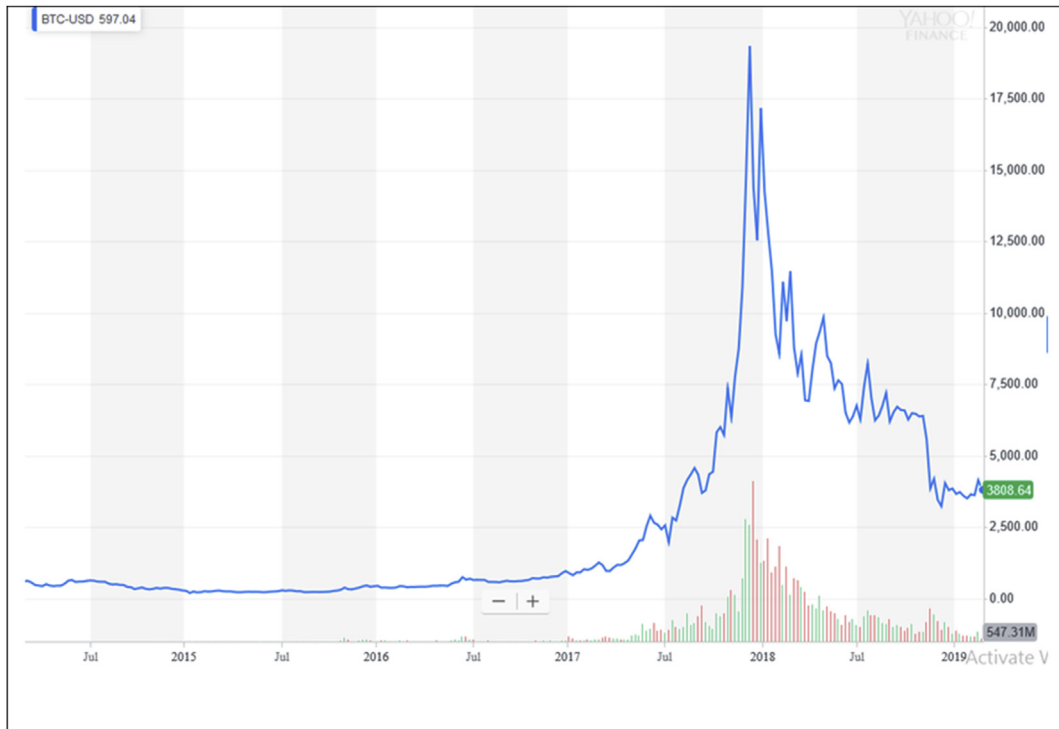
Figure 2. Price and volume of bitcoin trading.