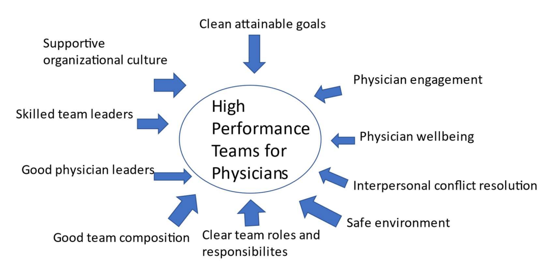
Figure 3. The critical dimensions for creating a high-performance team with physicians, in health care organizations.

Author Contributions: Conceptualization, S.W.R. and M.F.; data curation, S.W.R.; writing—original draft preparation, S.W.R.; writing—review and editing, S.W.R. and M.F. All authors have read and agreed to the published version of the manuscript.