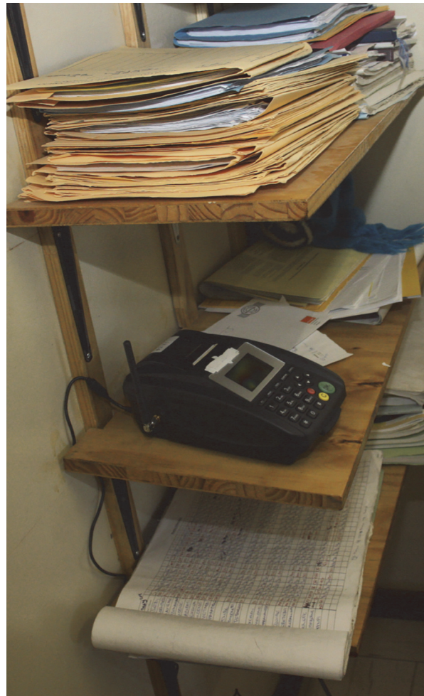
Fig 3. Mobile SMS printer in use. Printer is installed in an exam room of a study antenatal clinic.