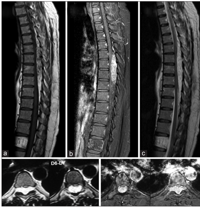
Figure 2: Sagittal and axial cuts of magnetic resonance imaging showing large, extradural, contrast-enhancing lesion extending from D5 to D8 with hemangioma in L1 vertebral body. (a) T1-weighted images. (b) Fat-suppressed postcontrast image. (c) T2-weighted images

DSA helps in delineating the vascular supply and in differentiating spinal angioliomatosis from AVMs. Embolization is not indicated as the feeders are diffuse and may jeopardize the normal supply of the cord. Total surgical excision is considered the best line of management in these cases. [17]