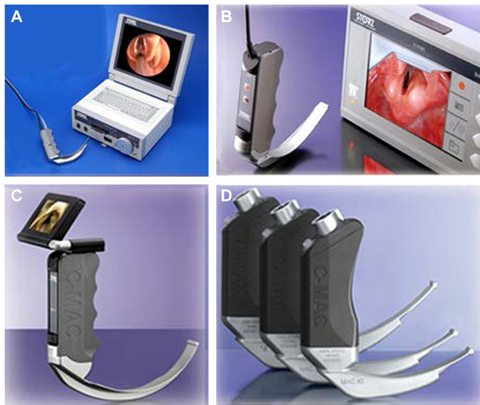
Figure 2 The C-MAC videolaryngoscope system.

Notes: (A) Storz Berci-Kaplan DCI ® videolaryngoscope (V-MAC videolaryngoscope); (B) Storz C-MAC videolaryngoscope; (C) portable C-MAC videolaryngoscope with a 2-inch pocket monitor attached to the handle; (D) the latest C-MAC handle with a lightweight and a multifunction interface. Copyright © KARL STORZ GmbH & Co. KG Germany. 80