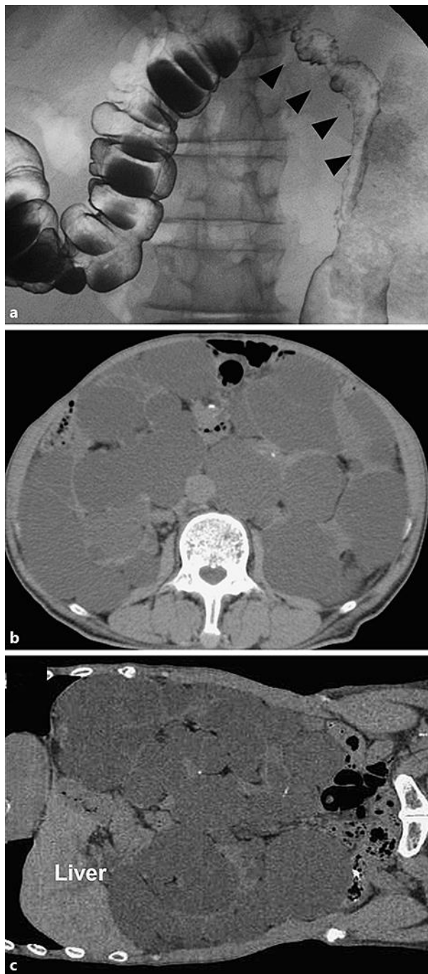
Fig. 1. Preoperative radiological examination. a Image from a barium enema examination, performed 2 months after the episode of ischemic colitis, revealing the development of stricture of the left colon that balloon dilation was unlikely to relieve. b, c Plain abdominal computed tomography images showing bilateral multiple renal cysts occupying a large proportion of the peritoneal cavity. No cysts were observed in other visceral organs, including the liver. b Horizontal plane. c Coronal plane.