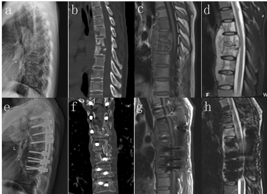
Fig. 1 A 33 year old male patient with T6-7 active spinal TB and paraparesis received one stage posterior spinal cord decompression, lesion removal, interbody fusion and pedicle fixation. (a-d) Preoperative images show cavity formation of vertebral body, disc necrosis, paraspinal and epidural cold abscess formation. (e-h) Postoperative image within 7 days after the operation show most paraspinal and epidural cold abscesses were removed through one stage posterior surgery, and good position of pedicle screw and interbody fusion was obtained