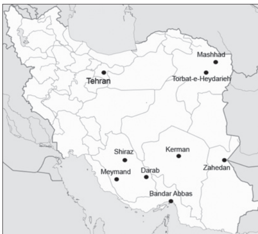
Figure 1: Cultivation locations of collected Ajowan samples in Iran

Dried seeds of Carum copticum were procured from medicinal plants markets of Iran having the information of the cultivation location [Figure 1]. In order to rule out any bias concerning the variability, we had collected three samples from each location. The collected seeds were rendered free from soil and impurities manually. Plant seeds were then authenticated by S. Khademian, the botanist of the Department of Traditional Pharmacy of Shiraz Faculty of Pharmacy. While the identification completed, each sample was deposited in the Shiraz School of Pharmacy herbarium with individual voucher number.