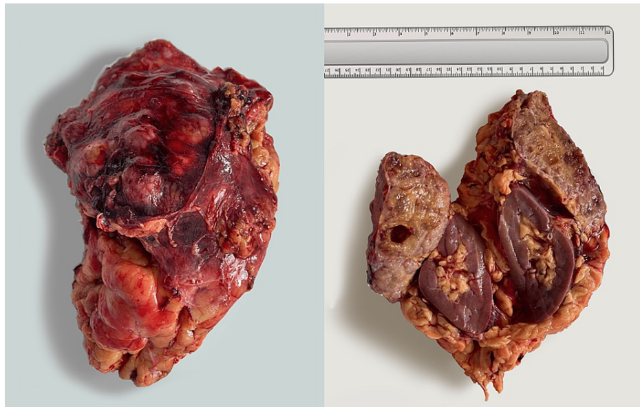
FIGURE 2: Macroscopic characteristics of the resected retroperitoneal tumor