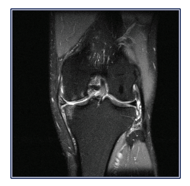
Figure 3 Magnetic resonance imaging of the left knee demonstrating a medial meniscal tear, herniation from the joint space with bone edema within the medial tibial plateau, and osteochondral damage on the medial femoral articular surface.

The patient underwent arthroscopy in September 2010, which revealed a degenerated medial meniscal tear, grade IV anteromedial lesion on the proximal tibia, and a grade 3 lesion on the opposing medial femoral condyle. A partial medial meniscectomy was undertaken with chondroplasty of the