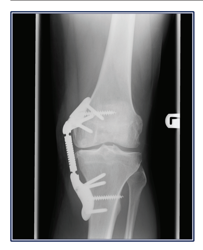
Figure 5 Weight-bearing radiograph of left knee demonstrating successful KineSpring® System following two-stage revision procedure.

with no complications. Postoperatively, the patient was instructed to gradually increase ambulation with the assistance of crutches while using minimal knee bending. The patient returned for follow-up visits weekly, which included visual inspection and microbial swabs of the wounds, until complete wound healing was realized. At 6 weeks, there was no evidence of infection, the wounds were well healed, and radiographs were unremarkable. At 3 months, the patient reported no wound problems, complete resolution of arthritic pain, and 120 degree range of motion with normal ambulation. Despite residual muscle weakness, the patient regularly engaged in moderate physical activity including walking, cycling, and tennis with no reported complications, pain, or joint dysfunction.