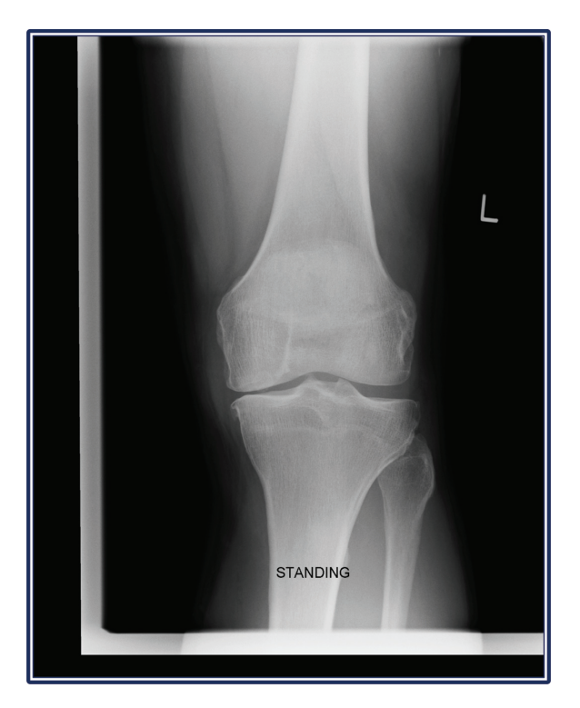
Figure 2 Weight-bearing radiograph of left knee demonstrating moderate narrowing of the medial joint space.

unstable chondral femoral flap. The patient returned 3 months later reporting that knee joint catching had improved although medial pain in extension during weight-bearing activity persisted. He also reported discomfort when walking distances and stated that he could not return to tennis because