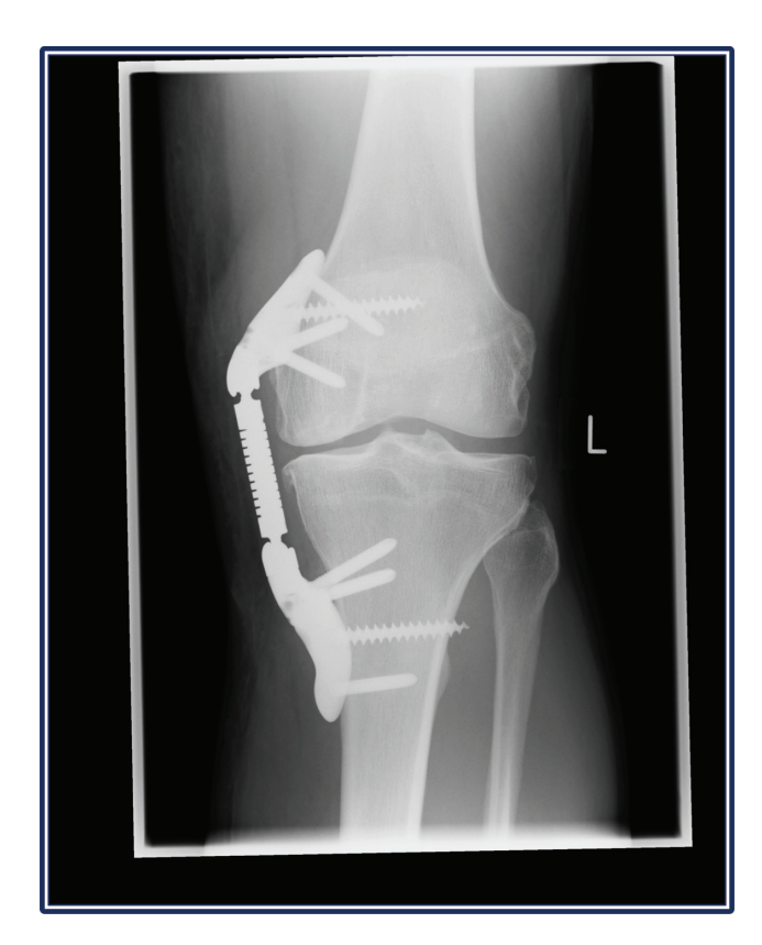
Figure 4 Weight-bearing radiograph of left knee demonstrating successful initial KineSpring ^{\otimes} System.

The patient underwent implant with the KineSpring System in July 2011. Arthroscopy was undertaken prior to implant, which confirmed grade 4 lesions on the medial femoral condyle and the medial tibial plateau. The KineSpring procedure followed standard techniques that have been described elsewhere<sup>11</sup> and was uneventful (Figure 4). The patient remained hospitalized for 2 days following the procedure. Although he was allowed to bear partial body weight and perform gentle range of motion exercises, he was instructed to walk with crutches for 2 weeks to encourage wound healing. The patient reported immediate arthritic pain relief in the postoperative period. At the 2-week follow-up, the wound was fully healed and range of motion was 90 degrees. He was encouraged to engage in only light