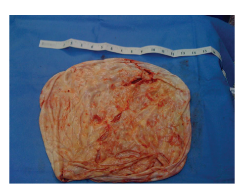
FIGURE 1: Huge ovarian serous cystadenoma specimen from patient 4.

consent was taken for possible conversion to laparotomy in case of technical difficulties or if there is an incidental finding of malignancy. All surgeries were performed under general anaesthesia.