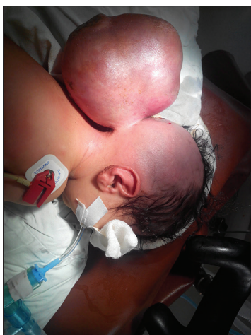
Figure 2: Preoperative picture of the same patient showing massive occipital encephalocele