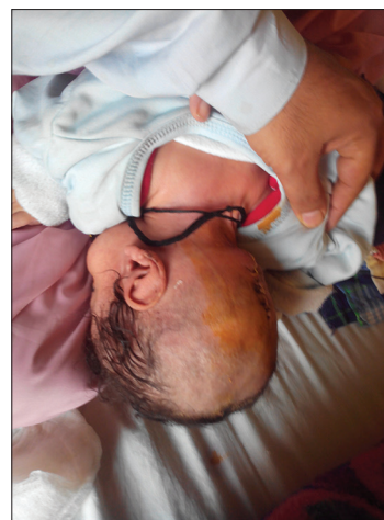
Figure 3: Postoperative picture of the same patient after resection of the encephalocele

patients (4%) diagnosed with Dandy–Walker cyst. 3 (6%) patients were suspected developmental delay and mental disorders. Eight (15%) patients also had seizure. None of the patients had neurological deficits in our study. Some of the swellings gradually increased in size from birth, while others remained static, or even decreased [Table 2].