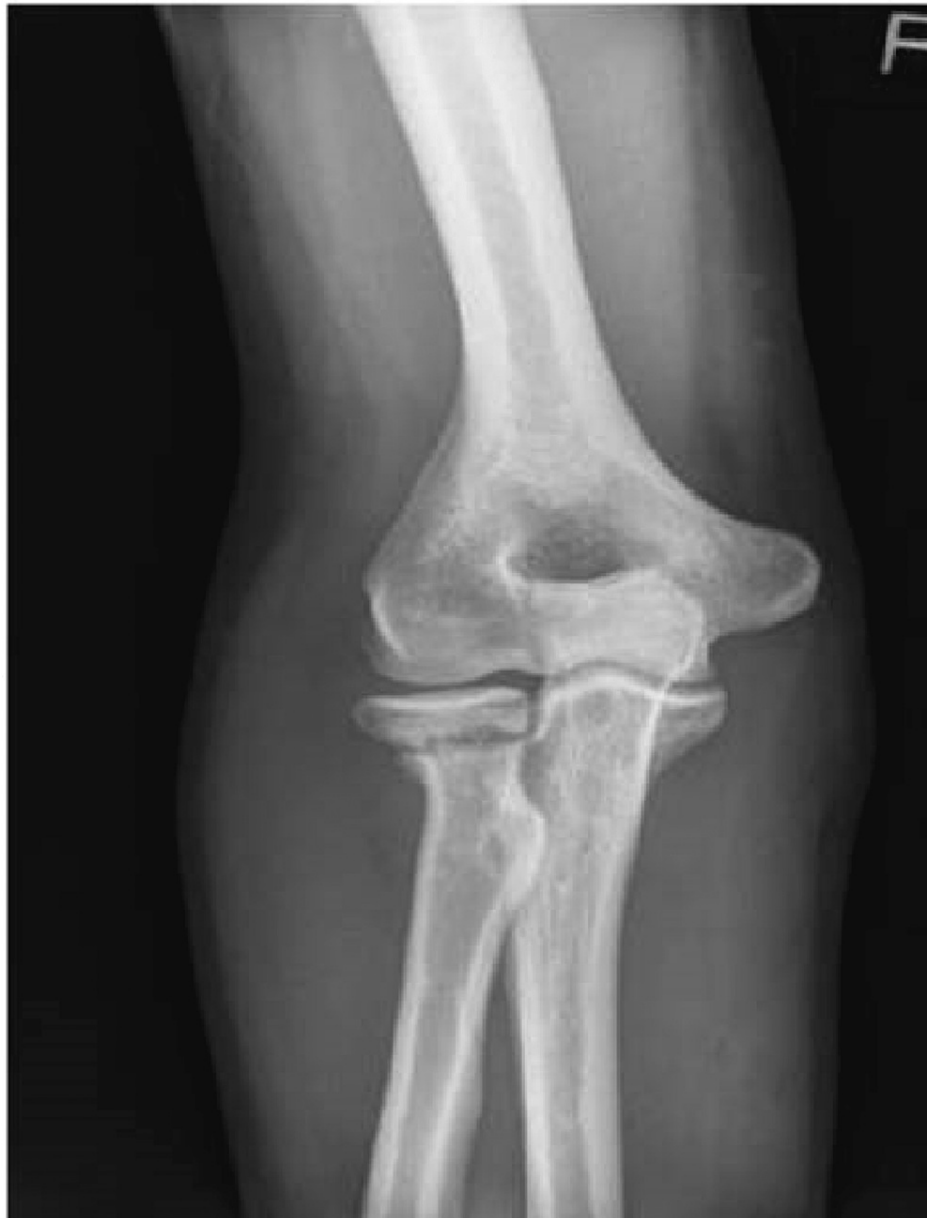
FIGURE 3: Xray demonstrating an example of radial neck nonunion

Reproduced from Pace et al. [23] with permission.