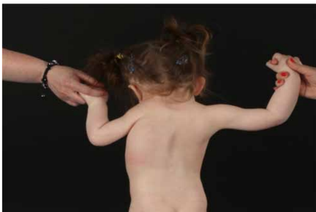
Figure 1 Sprengel's anomaly.

Microarray analysis of the genomic DNA using Bluegenome ISCA 60K Oligo Cytochip revealed