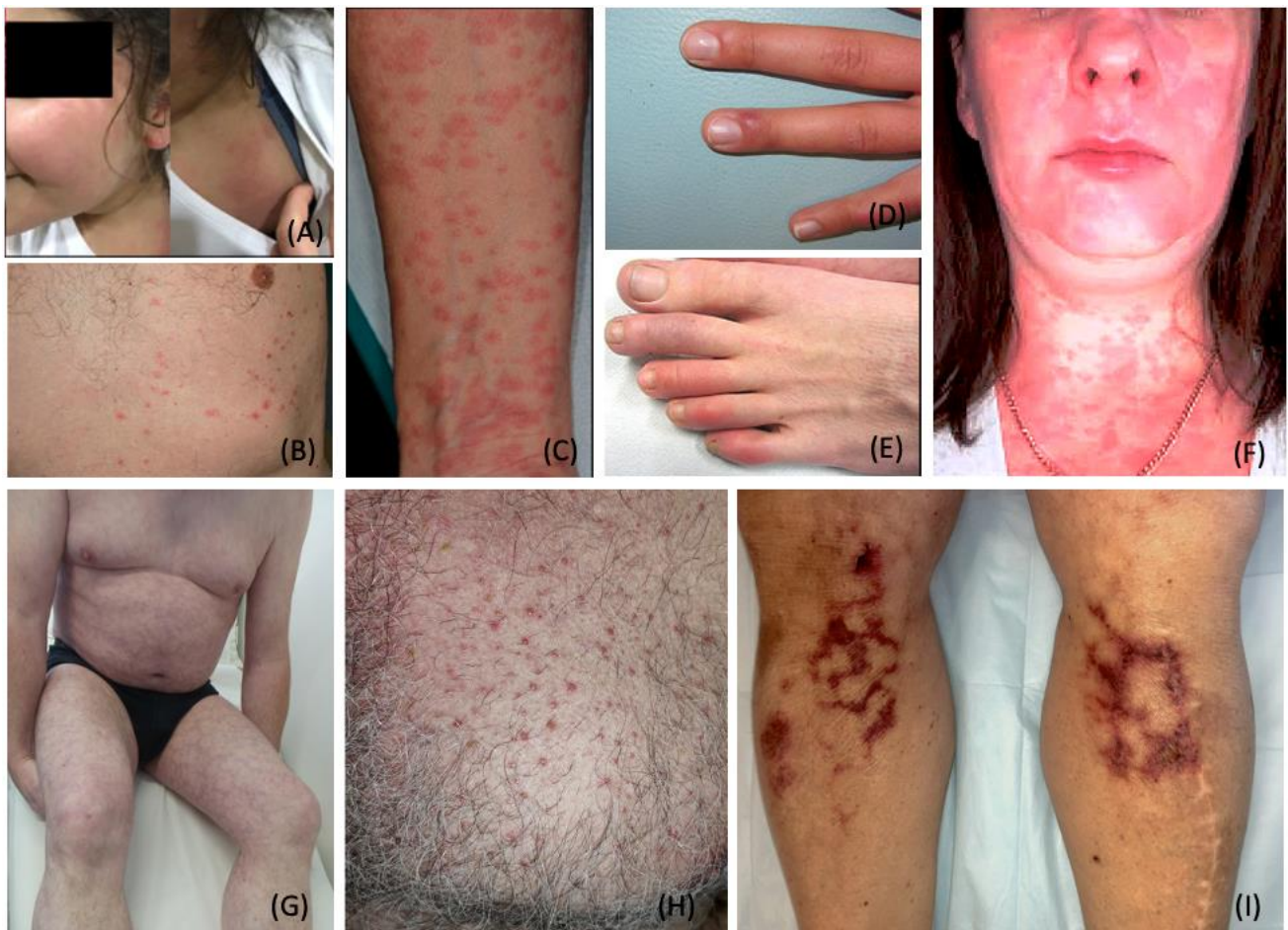
Figure 2. Cutaneous Manifestations Related to COVID-19 Infection. (A). Maculopapular rash observed on the face and shoulder of an 11-year-old child; (B). Varicella-like crusted papular lesions of the trunk; (C). Maculopapular lesions coalesced into small plaques on the anterior forearm; (D,E). Chilblains-like erythema of the fingers (D) and toes (E); (F). Urticarial erythematous eruption of the face, neck, and upper chest; note: no mild angioedema on the lower lip, due to excess interstitial fluid in the dermis and subcutaneous tissue; (G). Livedo reticularis: a symmetric regular lace-like network of the trunk and extremities (H). Monomorphic vesicles and pustules of the chest; (I). Retiform purpura of the lower extremities.