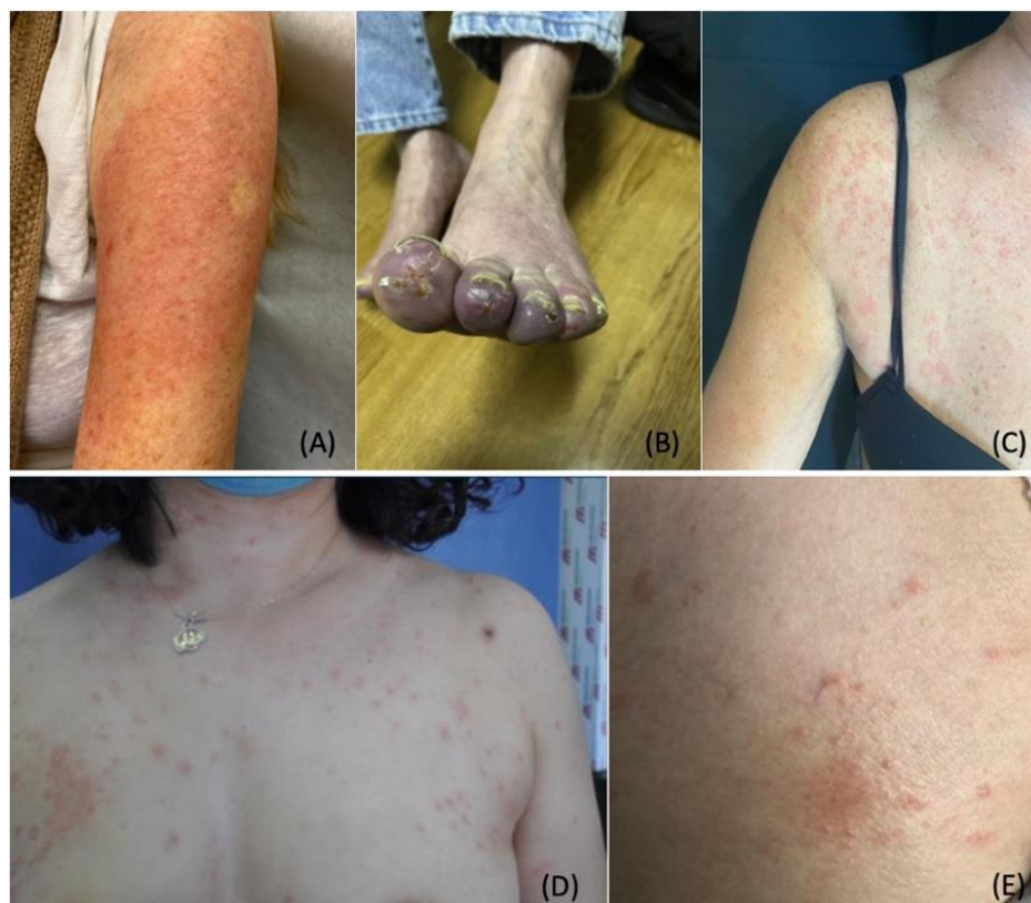
Figure 4. Cutaneous Manifestations Associated with COVID-19 Vaccination. (A). Pruritic and erythematous rash was observed on the left arm of a 74-year-old woman eight days following the inoculation of the Moderna vaccine. (B). Pernio/chilblains-like lesion of the toes observed in a 76-year-old man one week after receiving the second dose of the Moderna vaccine. (C). Urticarial wheals on the trunk of a 48-year-old woman three hours after receiving the second dose of the Oxford-AstraZeneca vaccine. (D,E). Oval salmon-colored plaques on the trunk and herald patch on the right breast of a 45-year-old woman four days after receiving the first dose of the CoronaVac vaccine.

rash, and purpuric reactions [37]. (Figure 4C) Furthermore, eruptions of rosacea have been documented after receiving COVID-19 vaccinations. Figure 4D,E illustrates a documented case of rosacea in a 45-year-old woman after receiving the Sinovac-CoronaVac COVID-19 DNA vaccine. Other reported cases of morbilliform rash progressed to severe dermatological reactions, including erythroderma, bullous pemphigoid, acute generalized exanthematous pustulosis, vasculitis, and urticaria [37]. The patterns of vaccine-induced rashes are similar to rashes described in association with SARS-CoV-2 infection [38,48,183]. It has been proposed that the host immune response, rather than direct SARS-CoV-2 damage, can cause these skin lesions [37,161]. Additionally, DTHR to vaccine excipients has been shown to play a role in the pathogenesis of these skin lesions [37].