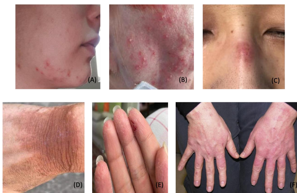
Figure 3. Dermatological Conditions Related to PPE and Hygiene Products. (A). Acne vulgaris; (B). Rosacea; (C). Pressure injury; (D,E). Irritant contact dermatitis; (F). Hand eczema; Photo credit is

Abbreviations: PPE, personal protective equipment.