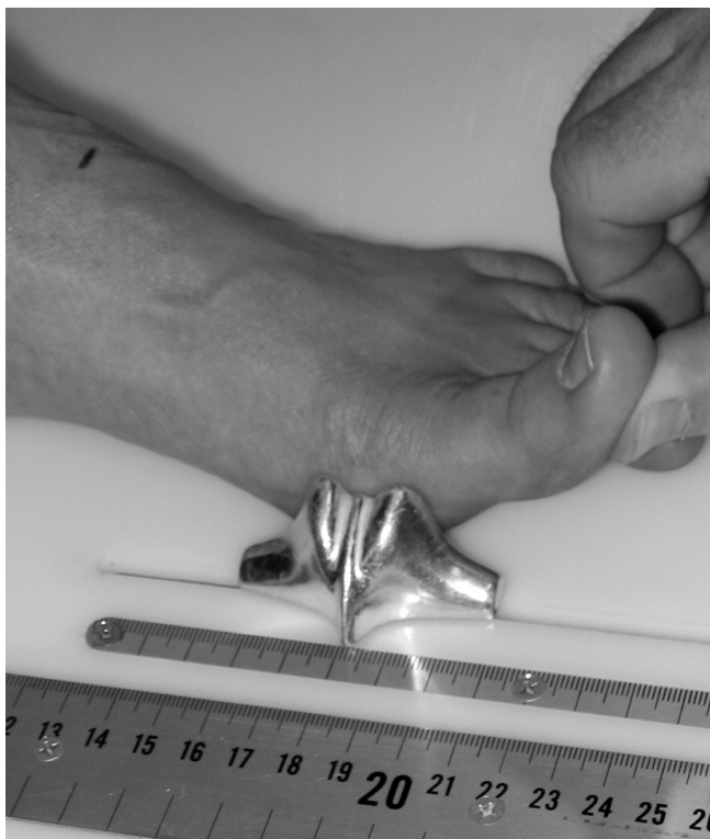
Figure 4 Extending first metatarsophalangeal joint to ensure proper placement of indicator.