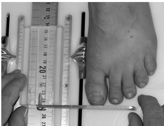
Figure 5 Placement of forefoot using first metatarsophalangeal joint indicator and measurement of total foot length.