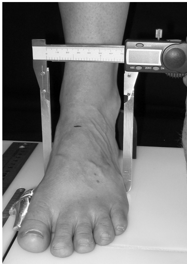
Figure 3 Digital caliper for measuring foot widths being used to measure midfoot width.

positioned at the midpoint of a 12-meter walkway to collect dynamic plantar surface area during walking. The EMED-X platform had a matrix of 6080 sensors with a density of four sensors per cm 2 and a sampling rate of 100 Hz. The input pressure saturation range for the capacitance sensors used in the EMED platform is 1270 kPa. In the current study, none of the trials performed by any subject achieved pressure saturation levels for the platform system.