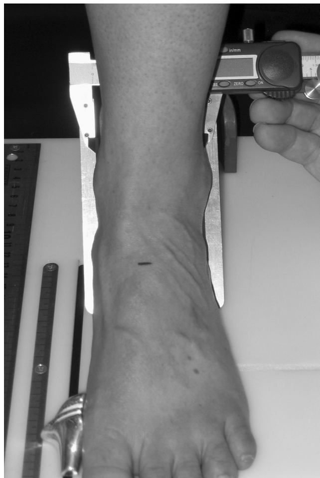
Figure 8 Measurement of heel width.

To assess the reliability for the six (6) foot measurements, three raters were asked to assess the left and right feet of 12 randomly selected participants. The raters performing the measurements were three physical therapists with a minimum of 2 years clinical experience (mean experience