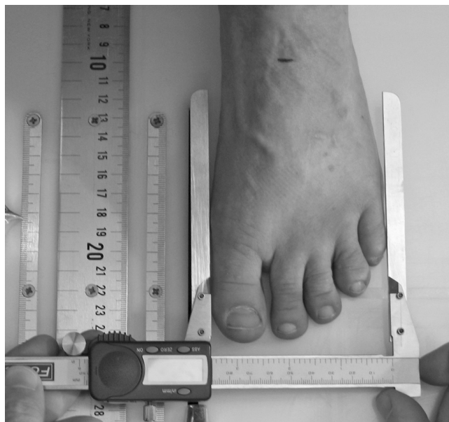
Figure 6 Measurement of forefoot width.