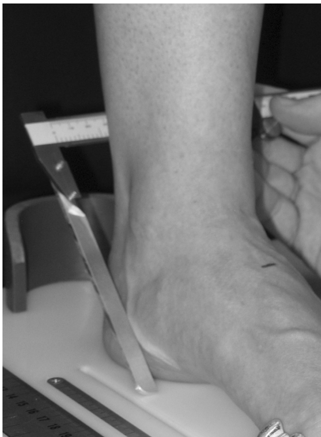
Figure 7 Placement of the digital caliper at 45° to the platform to measure heel width.

Once the foot measurements were completed, each subject was then instructed to practice walking barefoot at a self-selected speed along the 12-meter walkway for several minutes. In order to prevent targeting of the EMED-X platform, subjects were instructed not to look at the ground while walking. Walking speed was monitored using a digital stopwatch to time the subject as they walked between two lines positioned 6.1 meters apart and were equidistant in relation to the platform. When between-trial walking speed was consistent (variation of less than 5 percent between trials), each subject was asked to walk barefoot over the walkway while data were recorded from the EMED-X platform for five trials on both the left and right foot.