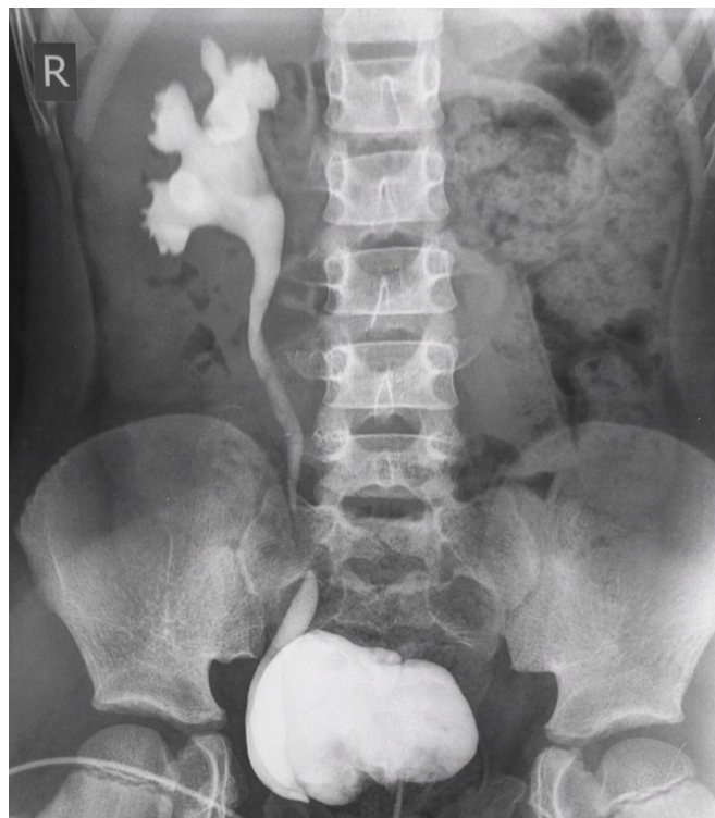
Figure 3 Five-year-old girl with unilateral grade 4 vesicoureteric reflux on voiding cystourethrogram.

Anatomical abnormalities of the renal system can predispose to UTI morbidity but are now often (but not always) detected on routine antenatal ultrasound screening in developed settings. Significant abnormalities warrant appropriate follow-up.