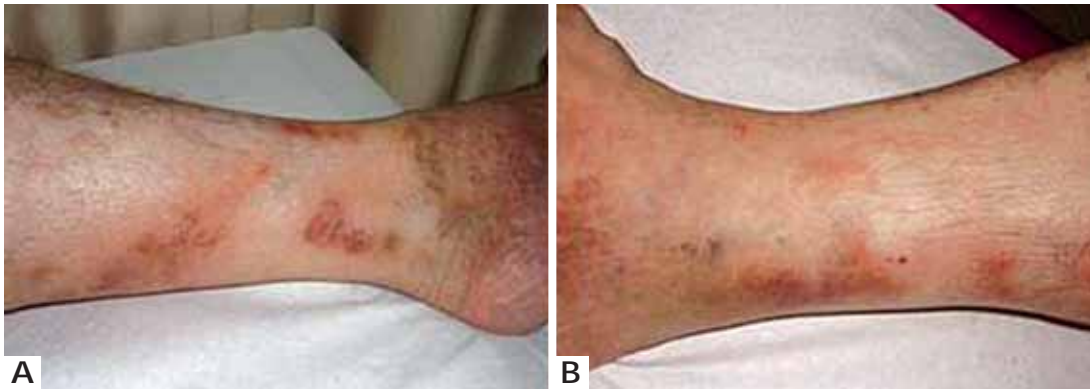
FIGURE 1: A. Erythematous indurated plaques and multiple varices; B. Similar clinical findings on the right leg

from degenerated fat cells processed by macrophages, metabolic disorders of lipids in mesenchymal cells, loops and fold in the basal laminae of fat cells in varying stages of lipid depletion at the time of necrosis; and ischemic injury of adipose tissue resulting from venous insufficiency are various mechanisms that have been proposed. 3 Our case had hypertension and superficial venous insufficiency, which were thought to be the underlying causes. Several clinical presentations comprising tender or nontender nodules, ulcerated or atrophic plaques, depressed lesions, diffuse swelling, and ecchymotic lesions may occur. 6 Our patient had tender, indurated plaques suggesting panniculitis, probably erythema nodosum or thrombophlebitis. The condition can only be diagnosed histopathologically by the presence of multiple, variably sized cysts in the panniculus, lined by an amorphous, homogeneous, eosinophilic membrane. This membrane may be flat and, in some cysts, be replaced by granulomatous inflammation. 3 It often projects into cysts, creating a pseudopapilla or arabesque appearance. 5 Our histopathological examination revealed similar findings, as well as dermal vascular hyperpla-