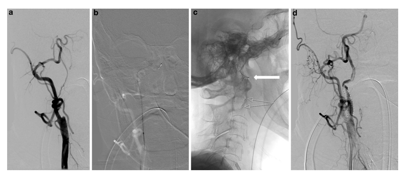
Fig. 4 Patient 9: 79-year-old woman with right ICA/M1 tandem occlusion. a The stump of the occluded ICA is well outlined in the a. p. projection of the DSA. b Anterior-posterior roadmap with the wire in the lumen of the occluded ICA pretends a straight course up to the petrous part. c Change of the course of the ICA following exchange of the stiff wire and placement of a filter wire ( fine arrows ) with a soft wire tip, which allows the ICA to reshape with a kinking below the skull base ( bold arrow ). d Dissection following stent placement extending into the now proximally kinked cervical segment of the ICA, which was treated with a second more flexible stent

stent, resulting in a dissection, which was treated in our 2 cases by insertion of a second, more flexible stent.