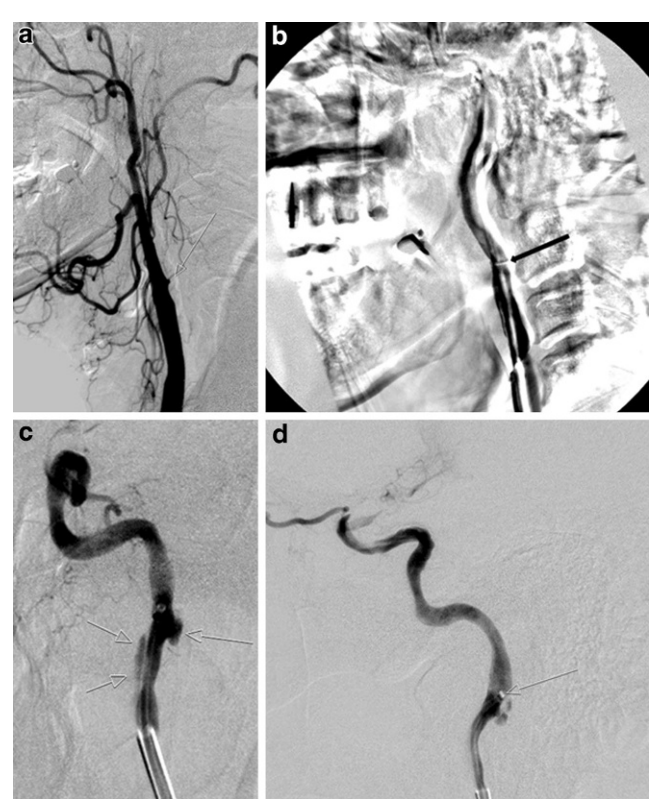
Fig. 2 DSA of patient 1, a 64-year-old man with an ICA/MCA tandem occlusion. a The stump of the occluded ICA can be identified in the lateral projection of the DSA ( arrow ). b Frozen image of the DSA series performed via the aspiration catheter, which has passed the site of occlusion. The original shape of the ICA is subtracted and outlined as white shadow behind the dark course of the ICA after ipsilateral turn of the head. The site of the dissection is clearly visible as a buttonhole stenosis ( arrow ). c , d The site and extension of the dissection ( arrows ) become visible after initiation of general anesthesia and thrombus aspiration through the 8 F guiding catheter with its tip distal from the site of occlusion

Elongation of the ICA, especially in combination with kinking and coiling, which has been shown to be asso-