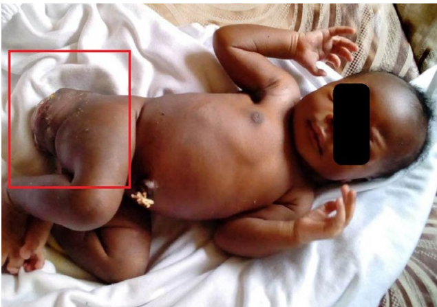
FIGURE 2 Image of sacrococcygeal teratoma in comparison with neonate

INR 1, BUN 30 mg/dl, hematocrit 33%, platelet counts 300000/l, and bilirubin 1.3 mg/dl. Cryptococcal antigen and syphilis serology (Venereal Disease Research Laboratory and Treponema pallidum hemagglutination assay) were negative.