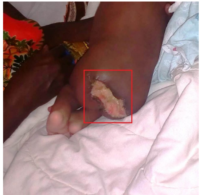
FIGURE 4 Perineal wound disruption and postoperative infection

material. Histopathological examination of the excised tissue revealed a multilocular cystic mature sacrococcygeal tumor with no evidence of malignancy. Immunohistochemical stains for AFP were positive.