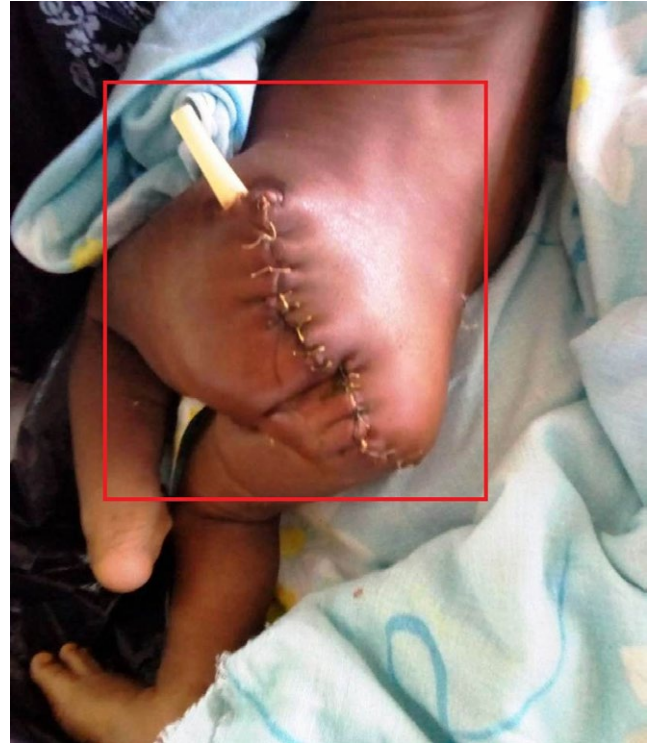
FIGURE 3 Initial postoperative sutures with drain in situ

An ulcerated cystic mass measuring 11cmX8cmX4.5cm with an ulcer measuring 4cmX3cm and weighing 175grams was resected. The mass contained cystic fluid and purulent