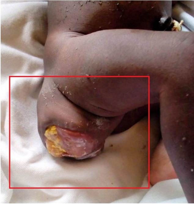
FIGURE 1 Image of pelvis showing sacrococcygeal teratoma in neonate