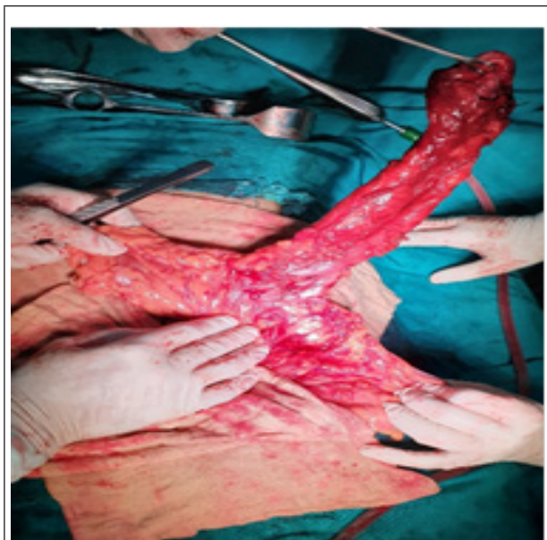
Figure 2. Intra-operative pictures showing duplication cyst with small communication ostium with a normal colon.

With the clinical diagnosis of the duplication cyst of the colon, she underwent left hemicolectomy and excision of the duplication cyst. Intraoperative findings revealed 35cm of tubular duplication cyst of the mid-transverse colon and the descending colon with the distal blind end attached to the retroperitoneum behind the second part of the duodenum (Figure 2 and 3).