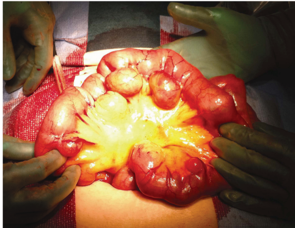
Figure 1 Jejunal diverticula. Intraoperative photograph demonstrating multiple jejunal diverticula. Note that the diverticula arise at the mesenteric border.

186 x10 9 /L, and C-reactive protein <5 mg/L. The bleeding appeared to have ceased and the patient was considered haemodynamically stable. She had no more episodes of rectal bleeding during the night or the next morning and was discharged with an urgent appointment for outpatient workup with colonoscopy.