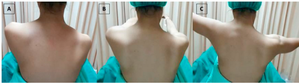
Fig. 1. (A) Asymmetric neckline with the prominence of the scapula. (B) Right shoulder flexion was 160/180 (C) Right shoulder abduction was 130/180.

The patient managed the symptoms by going to another hospital and underwent shoulder surgery. The patient was also going some isometric exercises at home, as taught by her primary care physician. However, the patient’s shoulder became more problematic, and her pain was so great that she had to make a constant effort to position her shoulder to prevent the illness. The patient also said that she feels the numbness of the right shoulder through the back, drooping of her right shoulder, and an asymmetric neckline with the prominence of the scapula. She had never participated into a formal physical therapy program for these symptoms, which is now, set down to worsening of her underlying symptoms and the pain by what she described as the relatively more recent “Lateral winging of the scapula”.