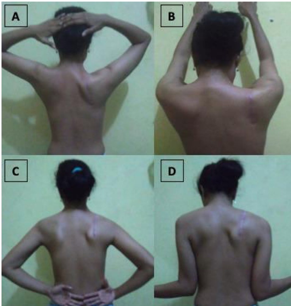
Fig. 4. A,B,C,D The patient Improvement motion in 3 weeks after surgery.

months [13]. However, our patient was injured 26 months before surgery, which made primary soft tissue repair was the right choice for this patient. Physical therapy and conservative treatment for spinal accessory nerve injuries more than 20 months have been shown to be unsuccessful because of the damaged nerve and inability to adequately strengthen adjacent muscle groups to compensate for the trapezius palsy. Therefore, the modified Eden-Lange procedure was chosen as the surgical treatment for our patient’s lateral scapular winging.