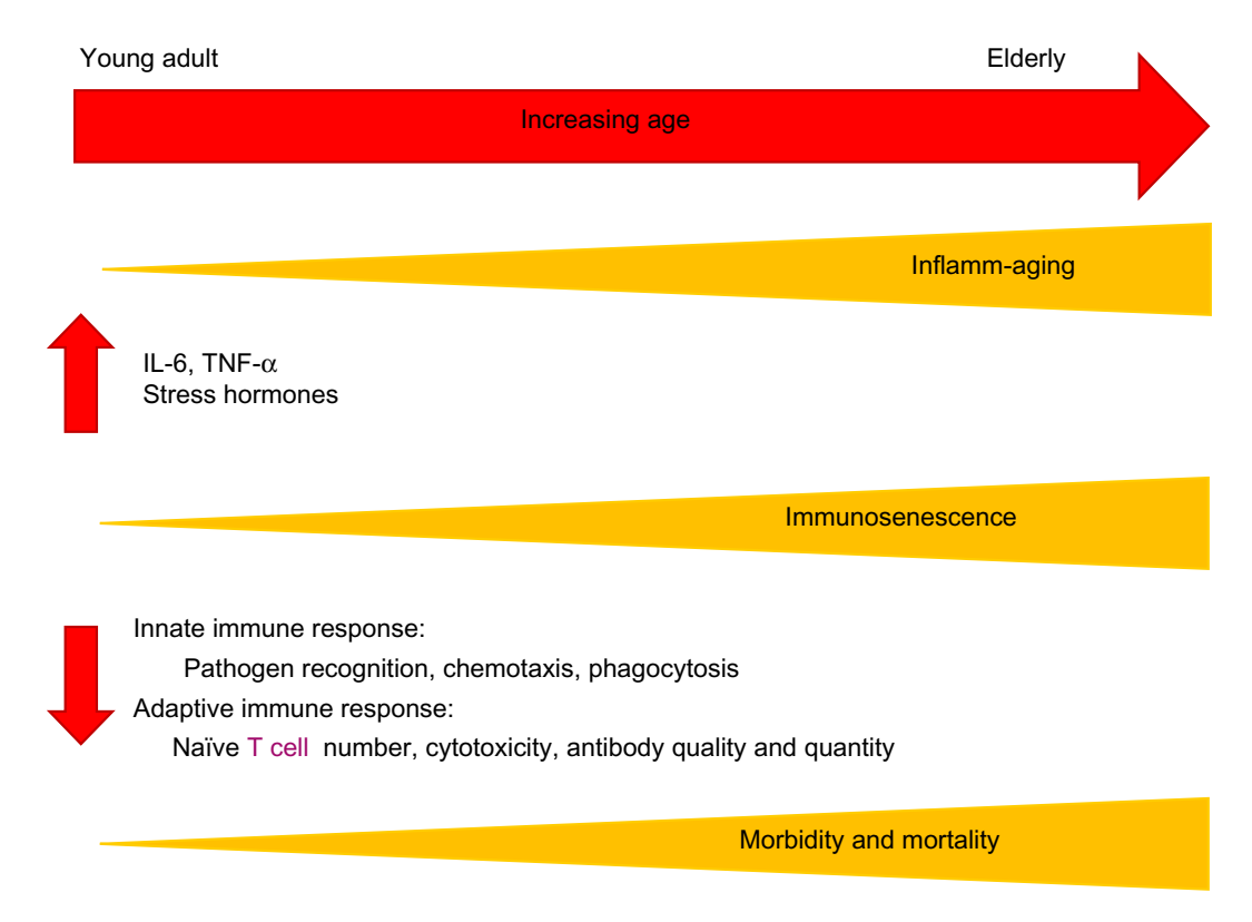
Figure 2 Increasing age leads to elevated basal levels of inflammation (inflamm-aging) and increased immunosenescence, which are associated with changes in both innate and adaptive immune responses, contributing to the heightened morbidity and mortality seen in the elderly. Abbreviations: IL, interleukin; TNF, tumor necrosis factor.

molecules in recognition and initiation of the innate immune response. In the context of aging, there are conflicting data regarding the impact of age on murine and human expression of TLRs or downstream signaling mediators. 38,49-51 While some of these murine studies on monocytes and macrophages report reduced expression of one or several TLRs, 34,49 another report demonstrates alterations in downstream TLR signaling involving p36.51 Reduction in p38 signaling is supported by studies in human monocytes from aged subjects, where dampened p38 signaling was associated with diminished phosphorylation of p38.37 Additionally, these authors observed a reduction in TLR1 but no changes in TLR2 expression. While the data are divergent on how aging impacts TLR expression, the data do suggest that alteration in the TLR pathways plays a role in an age-related aberrant initiation of the innate immune response and may contribute to an inability in rapidly recognizing and eradicating a pathogen. In studies of cigarette smoke exposure, elevated expression and nuclear translocation of nuclear factor-kβ murine neutrophil chemokines, CXCL1 and CXCL2, were observed in aged mice.<sup>52</sup> This was accompanied by a protracted