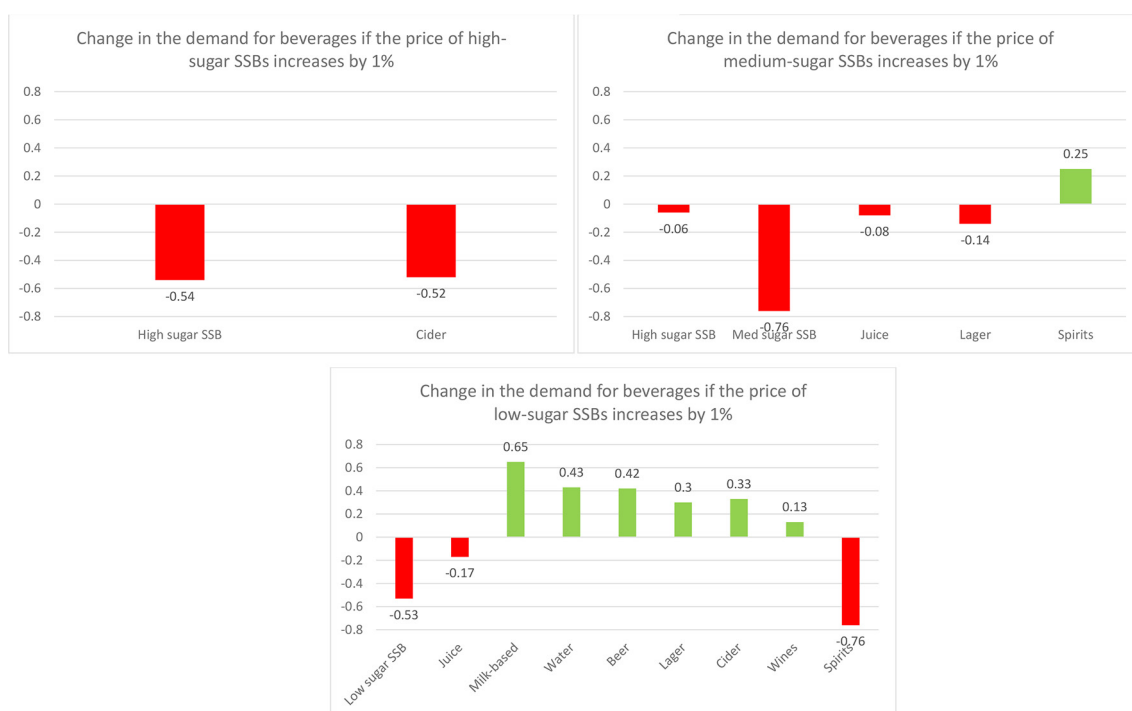
Figure 4 Change in the demand if price of SSBs increases (high-income sample; N=89 535). High-sugar SSBs include >8g of sugar per 100mL; medium-sugar SSBs include 5–8g of sugar/100mL and low-sugar SSBs have <5g of sugar/100mL.

recoup the levy from consumers with an option to increase the price of all drinks, including diet drinks. If so, this could reduce the beneficial effects from a rise in the price of medium-sugar drinks and add negative effects from diet drink price increases through the increased purchase of alcohol. Although not definitive, the relationships found in this analysis are sufficiently robust