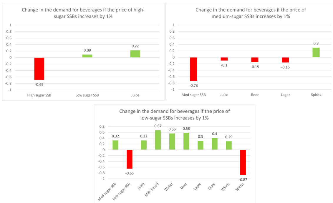
Figure 2 Change in the demand if price of SSBs increases (low-income sample; N=198 464). High-sugar SSBs include >8g of sugar per 100mL; medium-sugar SSBs include 5–8g of sugar/100mL and low-sugar SSBs have <5g of sugar/100mL.

middle-income group and decrease in cider for the high-income group. An increase in the price of medium-sugar drinks tends to reduce purchase of beer, and lager across all income groups, generating a ‘healthy multiplier’ effect for the price increase. An increase in the price of diet/low-sugar drinks, however, generates increased purchase of all categories of alcohol with the exception of spirits. On balance, a policy to increase the price of SSB needs