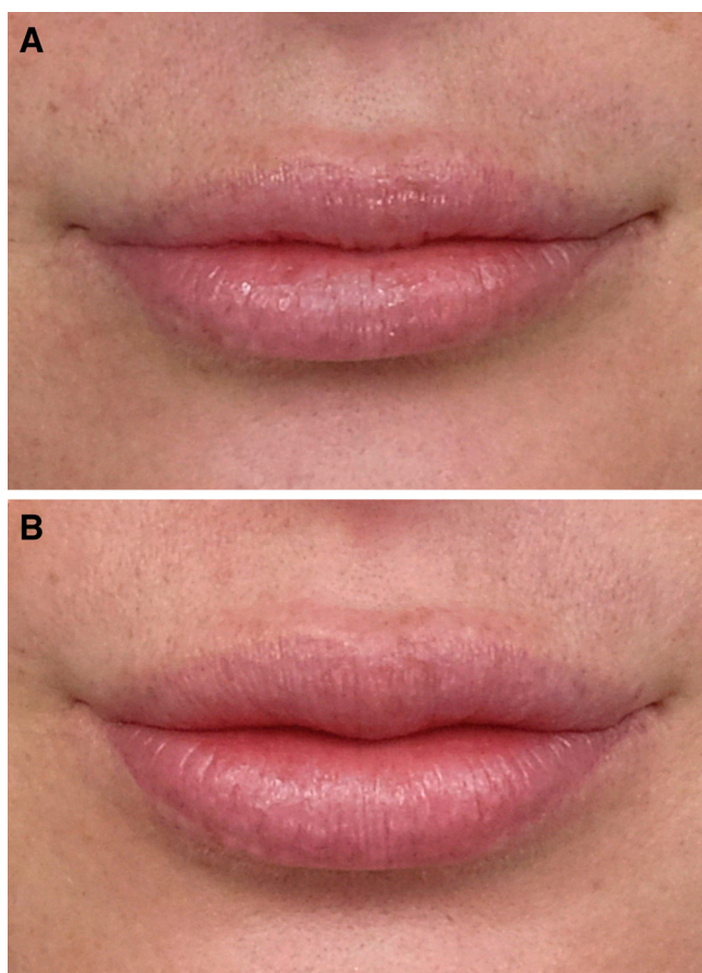
Fig. 4. Treatment of the lips using the LOVE approach. A 35-year-old woman before (A) and 25 weeks after (B) aesthetic treatment of the lips using HA fillers, based on the LOVE approach. The patient was injected with all three LOVE modules using a total of 1.6mL of HA filler (1.0mL VYC-17.5 and 0.6mL VYC-12).

By contrast, VYC-12 has a very low G' , which allows for superficial injection and hence improvements in fine lines and skin quality attributes—ideal for the hydration module. We believe it is rational to optimize the physical properties of the product used according to the specific aims of the procedure, even within the same area of the face (in this case, the lips). Some practitioners might consider it a limitation of the LOVE technique that it requires more than one product to be used in a single facial area. However, manufacturers have invested heavily in research to expand their injectable product portfolios and thus better meet varying clinical needs.