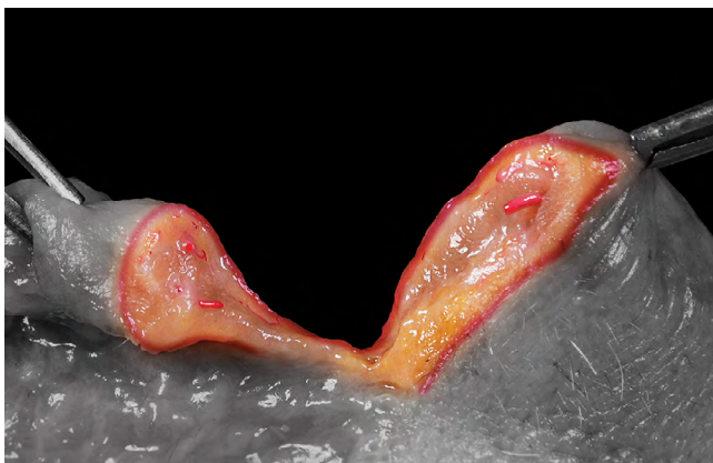
Fig. 6. Anatomical dissection of the lower lip. This shows the sectioned inferior labial artery within the orbicularis muscle. The superior labial artery of the upper lip can be found in a similar anatomical layer.

An important limitation of the present work was that all 60 patients were White. Optimal lip proportions are often highly specific to racial and cultural background, 31–33 and practitioners must be sensitive to these differences when managing diverse patient groups. For example, lip volume is typically greater among black populations compared with other racial groups, and there is a reduced tendency for volume to decline with age; 6,34 in Asian patients,