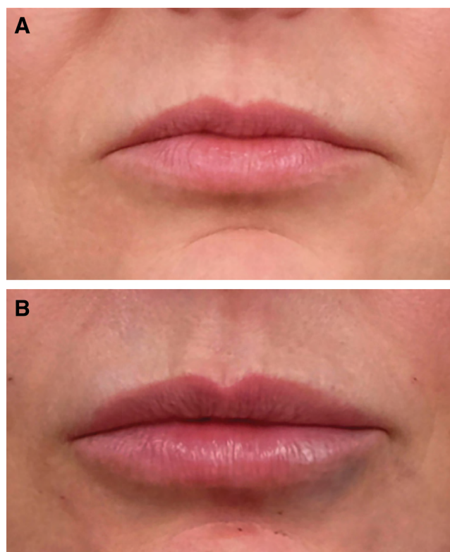
Fig. 5. Treatment of the lips using the LOVE approach. A 57-year-old woman before (A) and 26 weeks after (B) aesthetic treatment of the lips using HA fillers, based on the LOVE approach. The patient was injected with all three LOVE modules using a total of 1.8mL of HA filler (1.0mL VYC-17.5 and 0.8mL VYC-12).

VYC-17.5 was also used for the volume module. Previously, to restore volume to the lips, practitioners typically had to choose between stiffer products, which