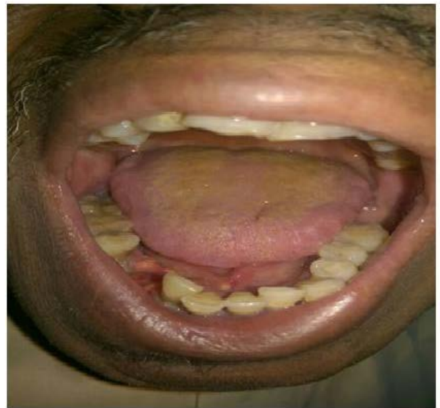
Figure 4. Patient's response after sorafenib.

tyrosine kinase inhibitor and sorafenib was chosen following discussion with the patient.