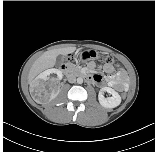
Figure 2. Computed tomographic image showing multiple pulmonary metastases.