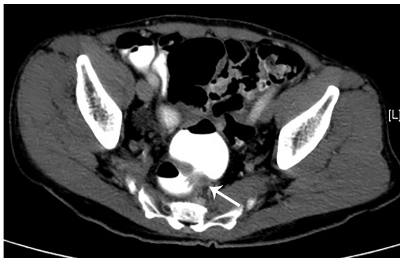
Fig 1. False positive category 2 scan—findings indeterminate for possible organic etiology and require further workup. Axial CT scan of a 74 year old male which demonstrates wall thickening of the rectosigmoid junction (arrow). Follow-up colonoscopy demonstrated no suspicious lesion at the rectosigmoid junction.

https://doi.org/10.1371/journal.pone.0200686.g001