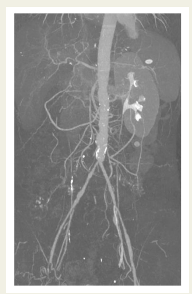
Figure I Computed tomography angiography (maximum intensity projection 3D reconstruction) showing multiple stenoses/occlusions of iliac and femoral arteries.

Lower limb function was assessed by means of the Short Physical Performance Battery test and the stair climbing test. ^{8,9}