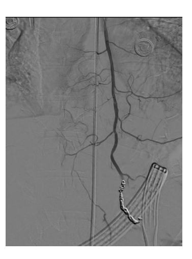
Figure 3: Selective coil embolization of the left superior Epigastric artery using 2 mm multiple coil placement.