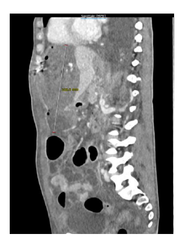
Figure 1b: Hemoperitoneum on the anterior liver surface at the computed tomography (sagittal plane).

Two days after selective embolization, laparoscopic drainage of the perihepatic hemoperitoneum was performed to reduce the infectious disease risk and 1200 ml of blood was drained.