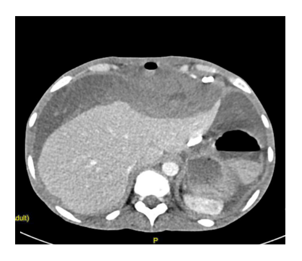
Figure 1a: Hemoperitoneum on the anterior liver surface at the computed tomography (transverse plane).