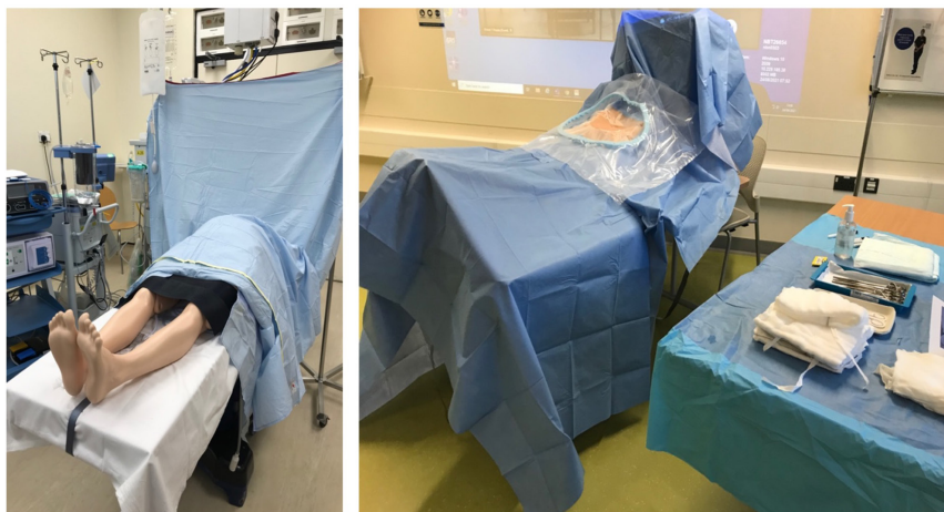
FIGURE 1 Prototype impacted fetal head birth simulator, complete with lower legs, in simulated theater environment.