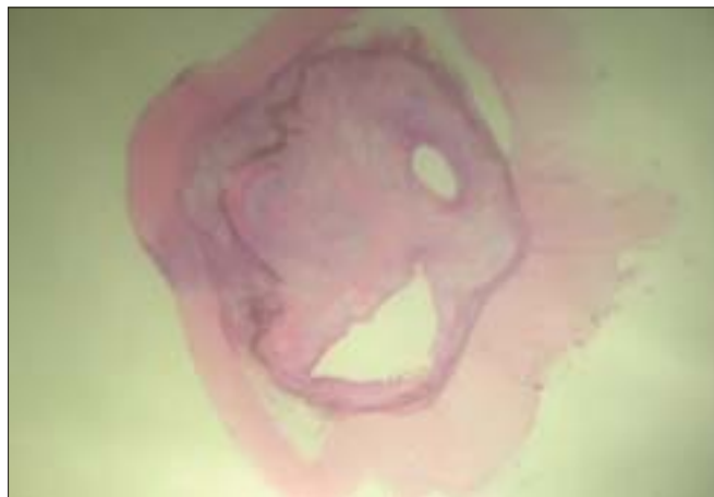
Figure 1: Intraocular inflammation in the vitreous cavity (1x)

As there was no visual potential, the right eye was enucleated. The globe measured 12 mm anteroposteriorly, 13