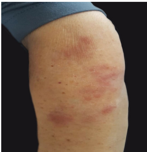
Figure 1 Multiple, painful, non-itching, purplish cutaneous plaques located on the left arm.