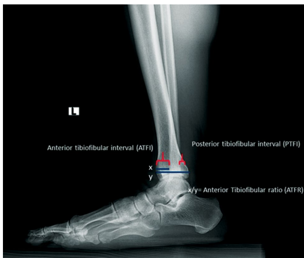
FIGURE 2. Lateral radiograph measurements.